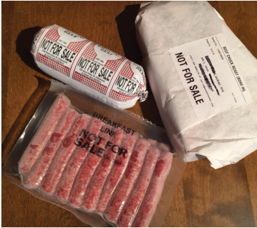
Prepared by Dr. Kathryn Polking, DVM, bureau chief, Iowa Department of Agriculture and Land Stewardship and Meat and Poultry Inspection Bureau.

As new agriculture entrepreneurs consider producing and marketing food products and current producers seek new markets, they need to conduct preliminary research to determine if there are rules, regulations, certifications, or licenses required for their product or selected market. This series of publications will help determine the requirements for licensing and for processing and selling various food products based on business size, sales volume, the level of processing, and market. The flowchart will guide Iowa producers and processors to the appropriate state agencies or departments. Agency and department contact information, as well as additional resources, are on the reverse side of this publication.